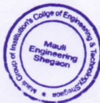
Principal Mauli Group of Institution's, College of Engineering & Technology Shegaon.